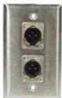
WP-203F 2 Mic