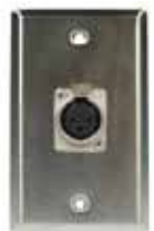
WP-103F 1 Mic

The bottom of the box has a 2" x 2-1/4" cut out with holes spaced at 3-1/4" inches. This allows you to mount any standard wall plate. Some examples are shown below.